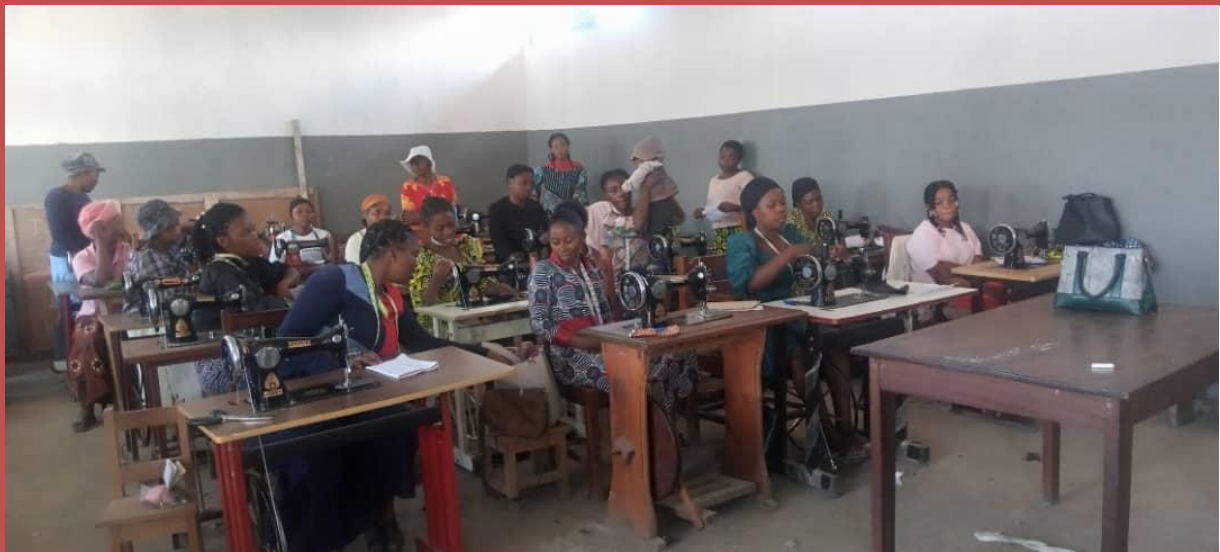
Photo of sewing workshop in our large hall