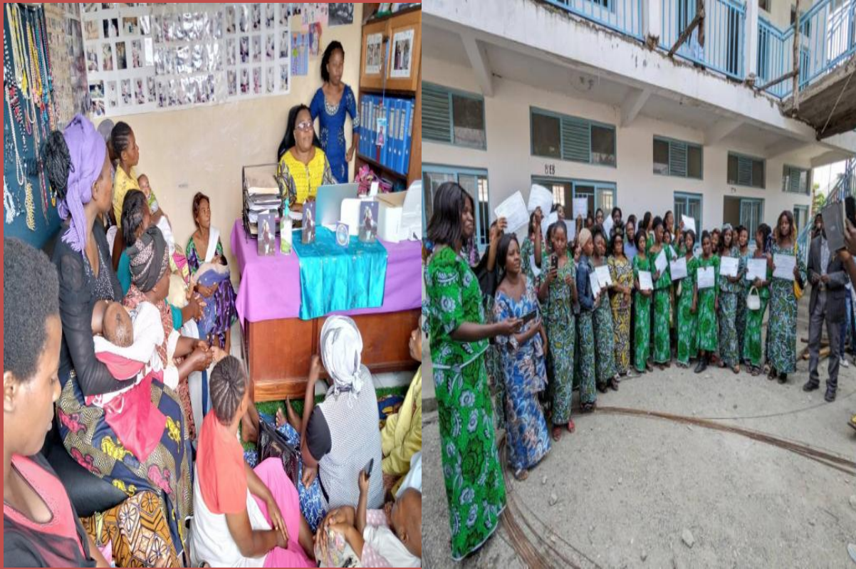
photo - Women in training workshop