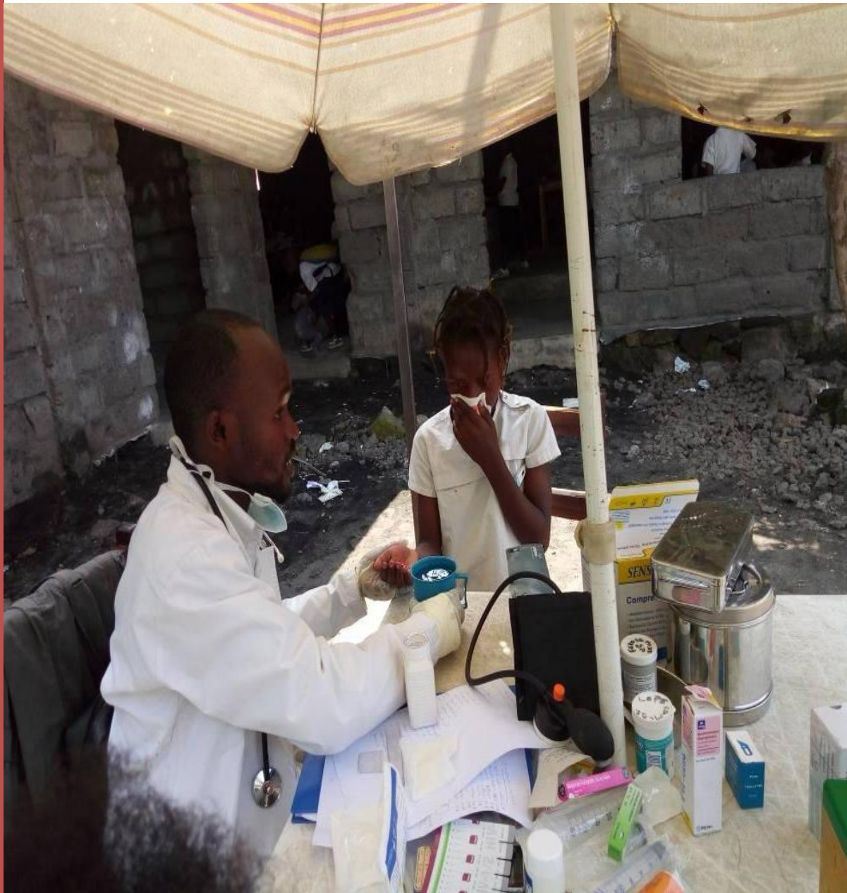
photo - Follow-up and care of malnutrition