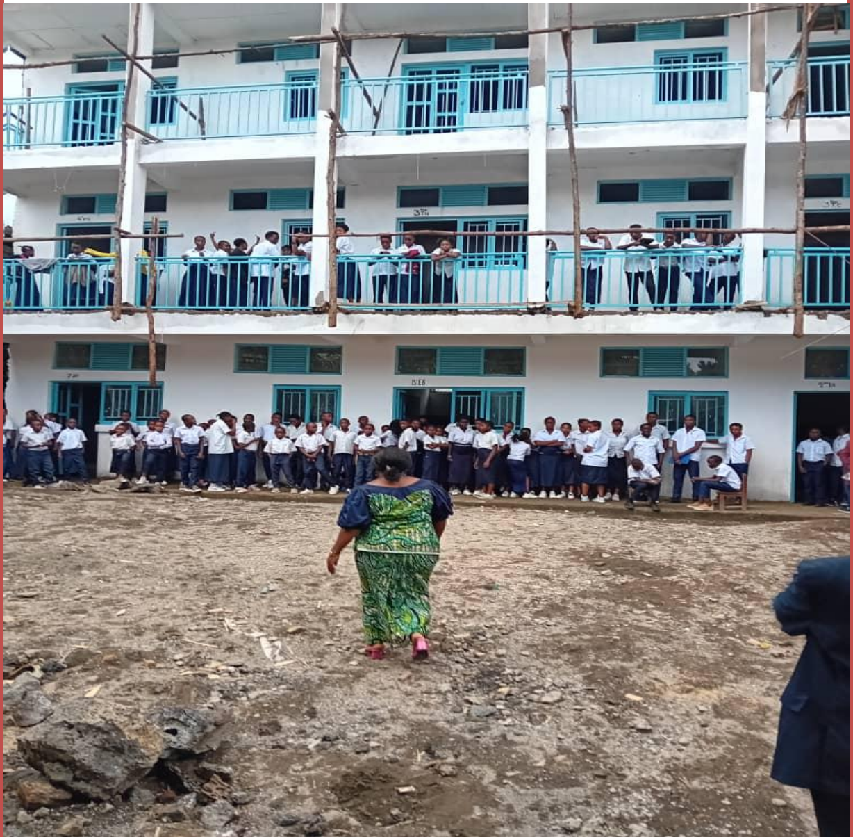
Secondary school building