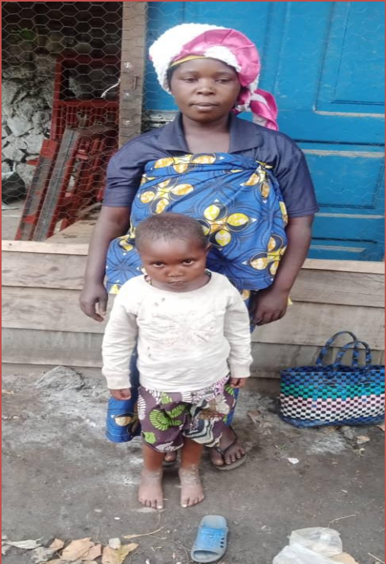
The miserable situation of malnourished children