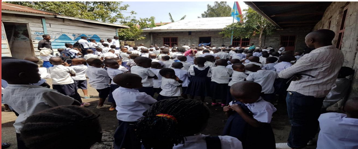
photo - Education and care of vulnerable pupils in a very small, suffocating space

In the five years from 2020 to 2025 the Lord gave us grace, the enlargement of the plot for a good development of pupils during recreation, the plot was 20M/25M but by the grace of God we found another plot and actually, the plot is 50M/20M.