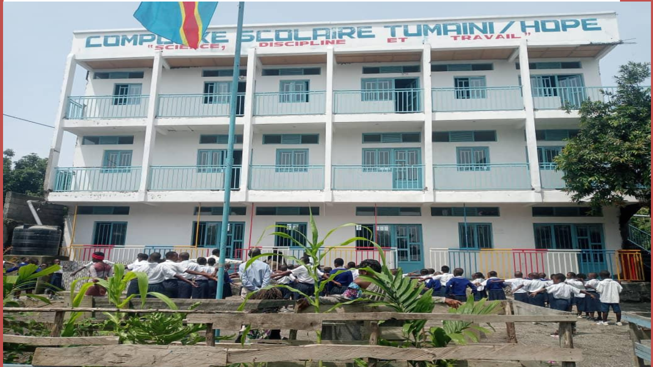
Primary school building

We present our thanks to all our friends who helped us. May God bless them.