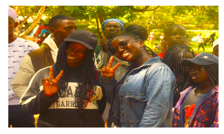
b)Last year team building exercise. 2024 November

scored B plain respectively. However, the success of our scholarship students was immensely attributed to the holiday programs that are routinely organized and timely executed. They include performance review, holiday tuition, Mentorship program and team building trip. Performance review helps us to identify areas of weaknesses that can be addressed in the holiday tuition while Mentorship program assists in familiarizing them with life skills that enables them to navigate through the school challenges. It enables them to deal with negative peer pressure, bad company and other juvenile behavior that may be common in their respective schools. Through the mentorship program they have been able to get to know God and live a Christian life in school. Team building trip has been significant in promoting cohesion among all scholars from form one to Form 4. It's a platform through which they are able to know each other, boost their pyschosocial need and make them bond as a family. Combination of all the above activities have been the secret card behind our success in this Project.