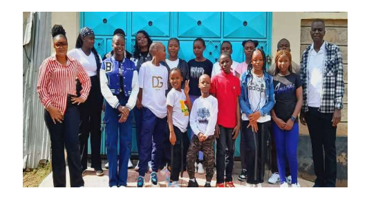
a Photo of Uzimatele Family home members