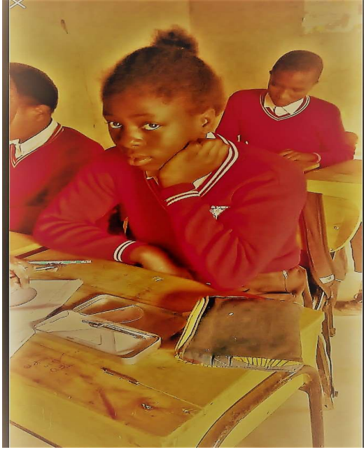
d:Photo of JSS learners in Class