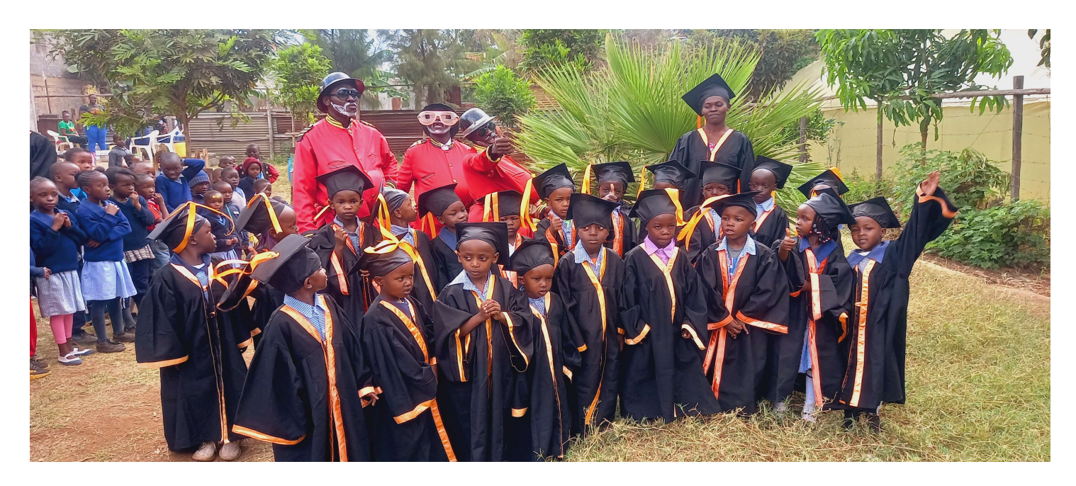
c:Photo of Uzimatele Education Centre Graduands 2024 class

end of the first week. Teachers too our not left behind as some were even doing follow up of some of the learners during the December holiday. On the openning day, learners were full of eargerness and passion to draw knowledge from their teachers with the hope of chasing their future dreams. Noticeable in particular were Junior school students. We are glad to announce the welcoming of grade 9 learners who will be preparing to seat for their transition National exams at the end of the year. As a matter of fact this year we shall be having two national exams i.e one for grade 6 to transit to grade 7 (KPSEA) at the Junior school while the other one is for grade 9 (KJSEA) to transit to Sinior school in grade 10. The future for our Uzimatele Education centre learners looks bright. We are forever gratefull to our partners for the immense support they have given us over the years in regard to our Education center.