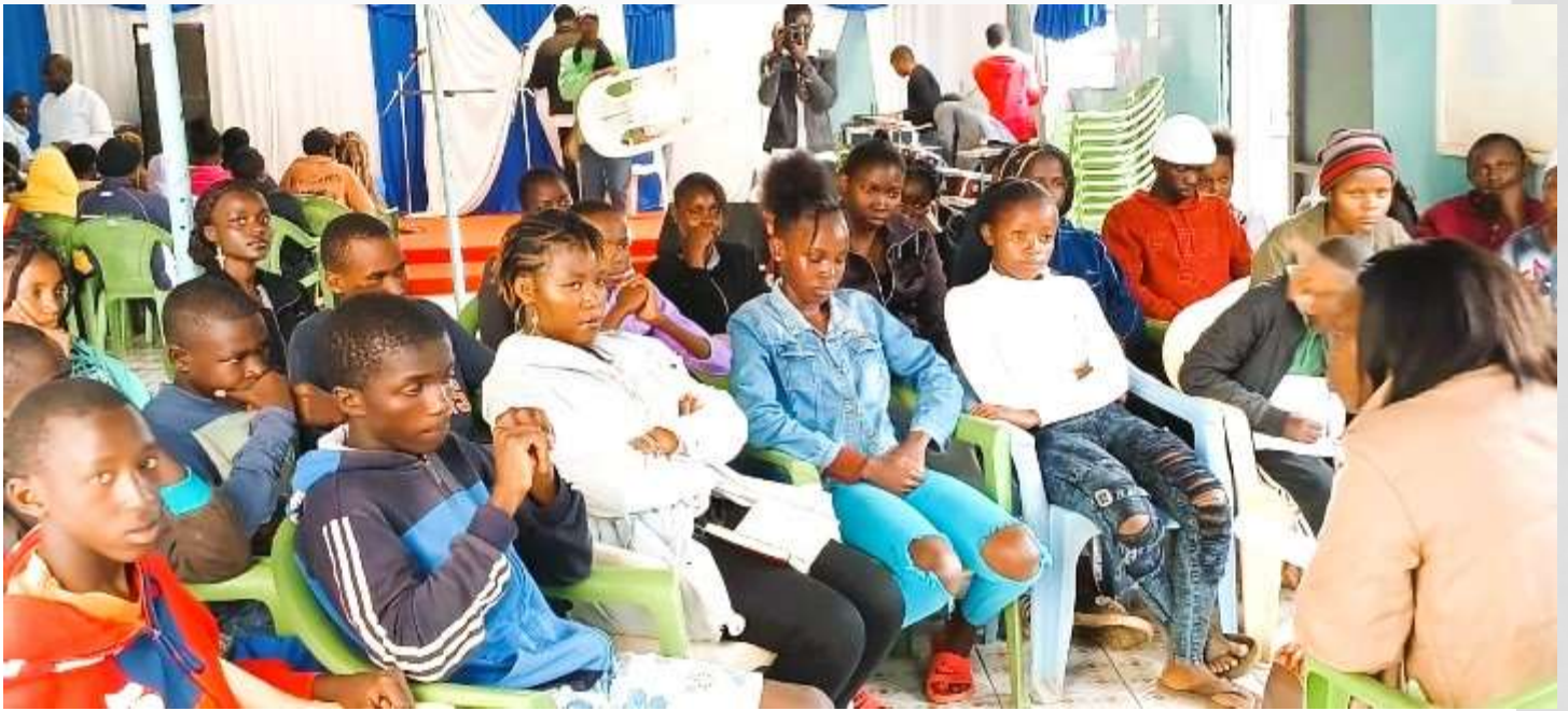
High Concentration during mentorship program