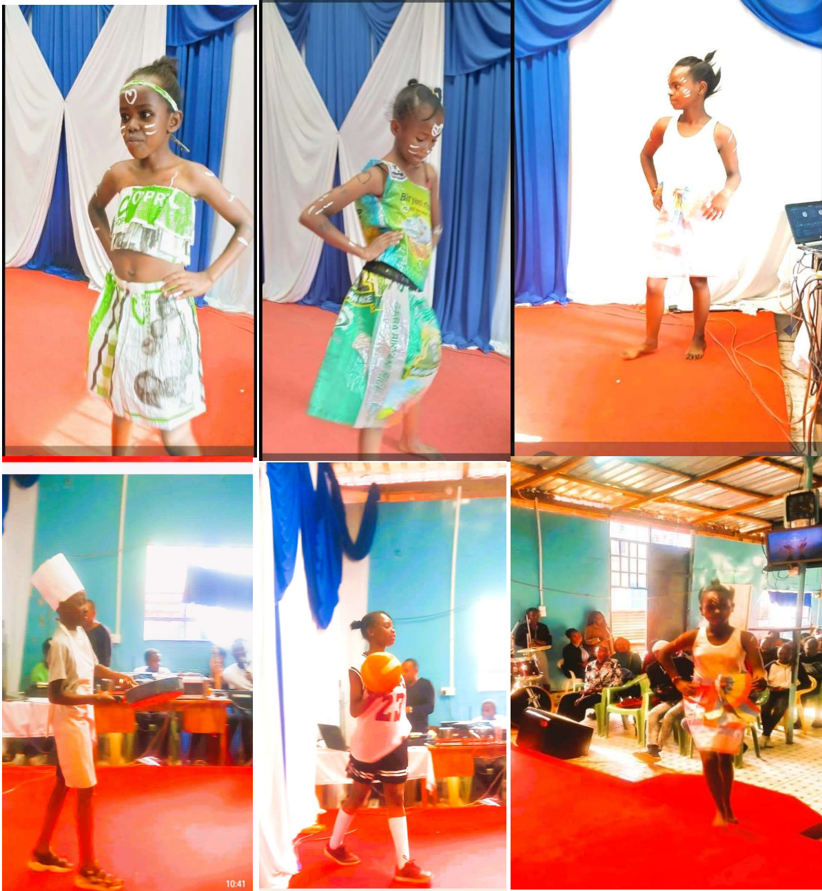
Modelling sessions under different categories