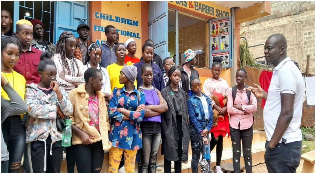
Scholarship program students ready to go for the team building. Photo: outside the Office

Above is the new form one recruitment exercise and scholarship program holiday tuition.