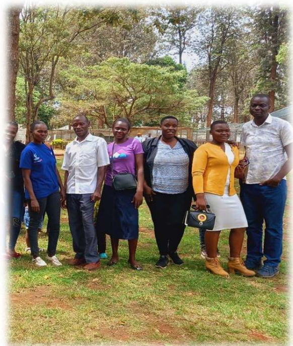
Uzimatele Education center teaching staff accompanied children to an educational trip.