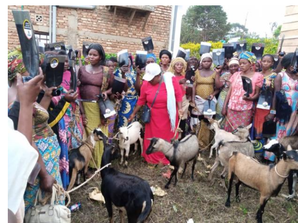
Women's agricultural project