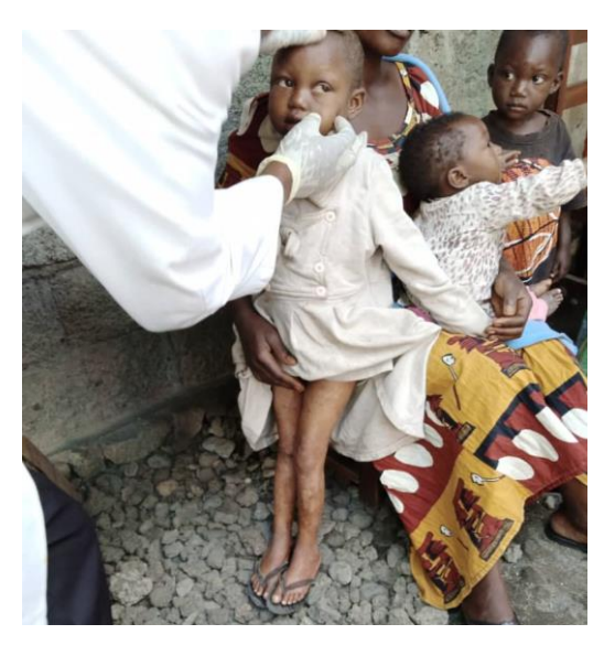
Healthcare for children